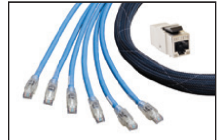
10GX Shielded Pre-Terminated Cable System

With simple planning, easy ordering and rapid delivery, the 10GX Shielded Pre-Terminated Cabling System will drastically reduce installation time and labor cost. In addition, this "green" system provides for plug-and-play installation and component reusability, resulting in lower installation cost and less waste.