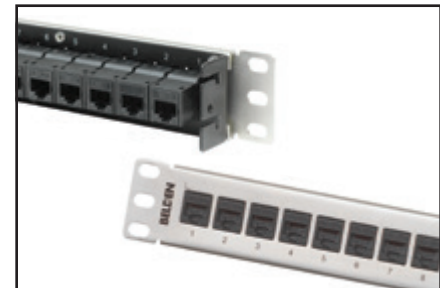
10GX KeyConnect Patch Panels (Preloaded)

Empty Patch Panels can be used when colored couplers are used