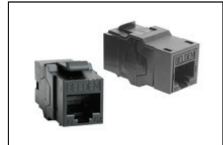
10GX RJ45 Coupler