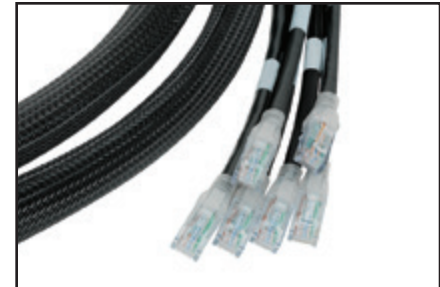
10GX Pre-Terminated Cable Assemblies

With simple planning, easy ordering and rapid delivery, the 10GX Pre-Terminated Cabling System can reduce installation time and labor costs by as much as 90 percent. In addition, this "green" system provides for plug-and-play installation and component reusability, resulting in lower installed cost and less waste.