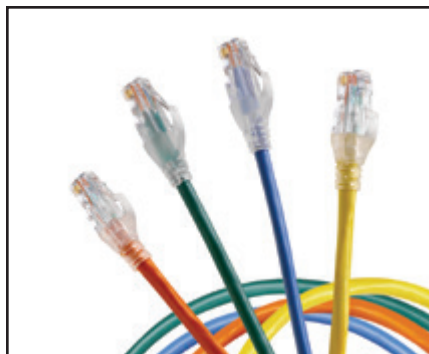
CAT5E Patch Cords