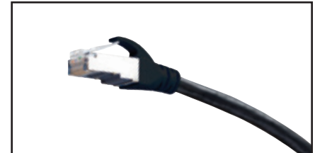
CAT5E Shielded Modular Cord