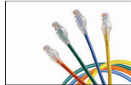
CAT6+ Bonded-Pair Patch Cord