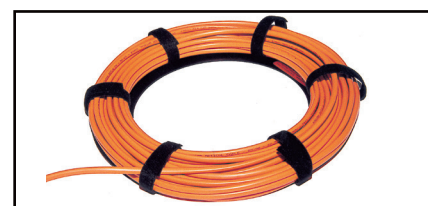
AX102516 Cable Slack Management Ring - 12" diameter