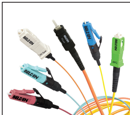
FX Brilliance Universal Connectors

Brilliant in design and universal in implementation, FX Brilliance Universal no-epoxy, no-polish, no-crimp field-installable connectors make fiber field termination faster, easier and better with our industry-leading design.