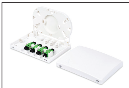
FWSWBF04SB, FX W-Box, 4 x SC/APC Simplex