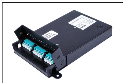
FW3MBP06LD, FX M-Box Pre-Term, 6 x LC Duplex, 1 MPO-12(f), OM3